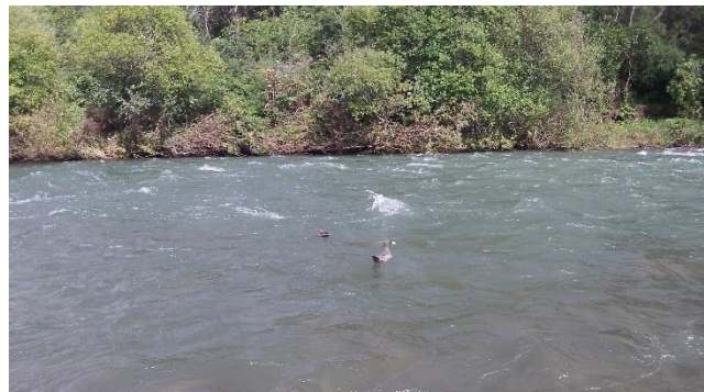
Go the Whio!