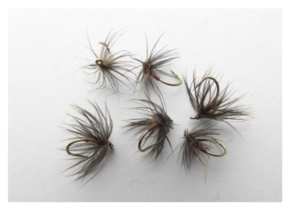
Spiders using starling hackle.