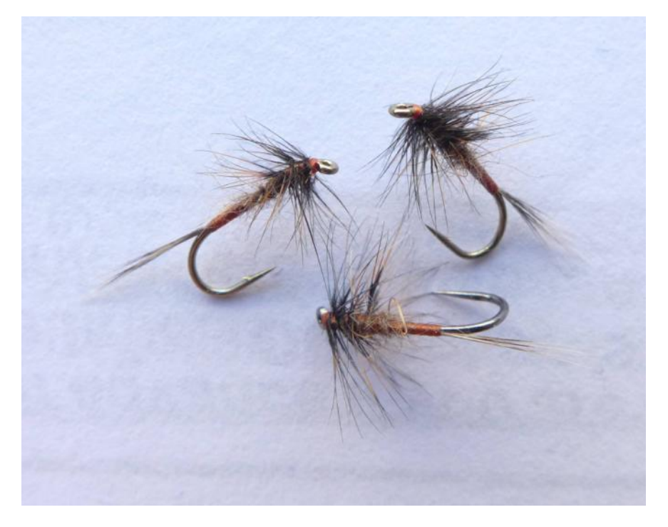
Wingless wet flies.

Spiders can also be tied on the same standard nymph hooks. There is the issue then of what to do with the long hook shank. My choice is to use a short shanked hook for the old umbrella-shaped spiders, the Kamasan B160 being my favourite. We can tie spiders also using the reverse hackle technique but if you want to make a stronger fly, I'd suggest we tie the traditional way – tip first. When using game hackles like grouse, woodcock or partridge, tying in tip first is an excellent method of tying spiders. If we use starling hackles, the feathers are generally more elongated than game hackles and suit tying reverse hackle or tip first, equally well.