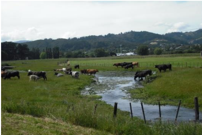
Photo of Hutt River feeder stream complete with fenced riparian strip.

Only problem is that the livestock are fenced into the stream bed instead of being on the outer side of the fences!!